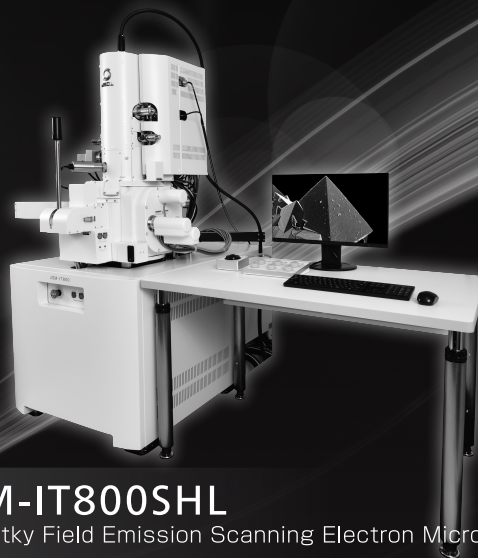
JSM-IT800SHL Schottky Field Emission Scanning Electron Microscope