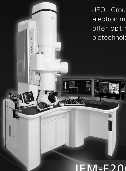
JEM-F200 Multi-purpose Electron Microscope

JEOL Group was established in 1949, as a company to develop and manufacture electron microscopes. As a leading electron-microscope company, we of JEOL will offer optimum solutions in a variety of fields including nanotechnology, biotechnology and life science.